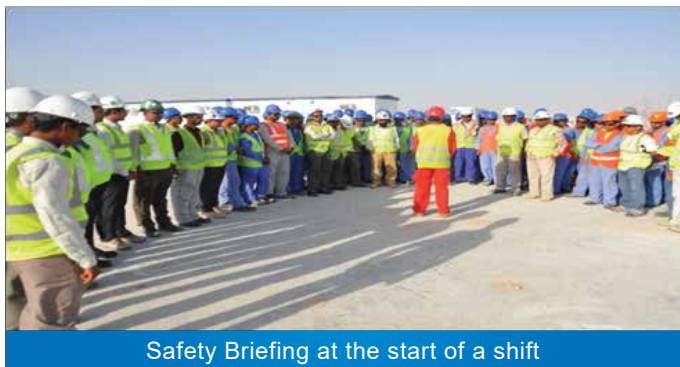
Safety Briefing at the start of a shift

Ammico has a proven safety track record of multimillion accident and incident free man-hours working on major projects in the oil & gas sector, infrastructure works as well as high - rise and industrial projects . Our workers are trained for: